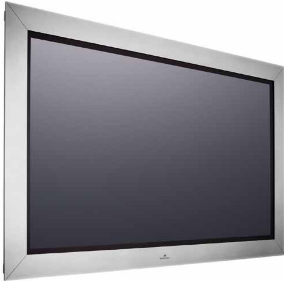
42" Arthur Holm Static monitor

If you are looking for an exclusive and elegant professional monitor for meeting and conference rooms, corporate reception areas and hotels, Arthur Holm's Static is the solution.