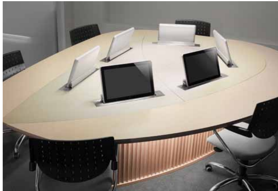
Installation of Dynamic 2 monitors