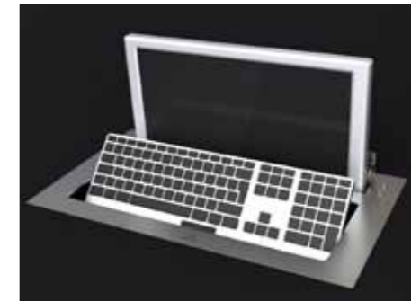
Dynamic monitor with keyboard

Arthur Holm and Albiral offer a selection of unique, elegant, versatile, flexible and ergonomic products that are now being used in the meeting and conference rooms, reception areas, auditorium and public zones of leading companies throughout the world.