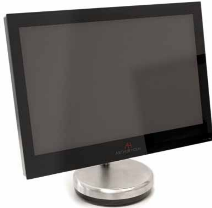
Tabletop monitor has a protective glass and brushed steel base

E legant desktop monitors manufactured in milled aluminum and with a stylish protective glass panel with black marking, with a support and base built of brushed stainless steel. With its smart design, all cabling is integrated into the support all the way down to the base.