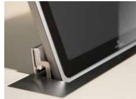
Close-up on the table plate