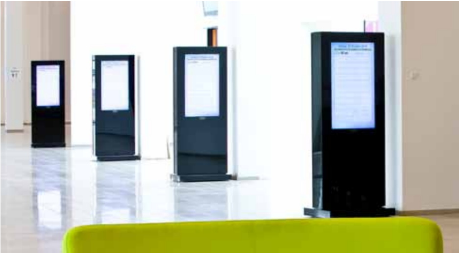
Arthur Holm Totems

Totems and kiosks from Arthur Holm are used as elegant, state of the art points of information in reception areas and hotels. They can be 100 % customized to fit the customer's interior design requirements.