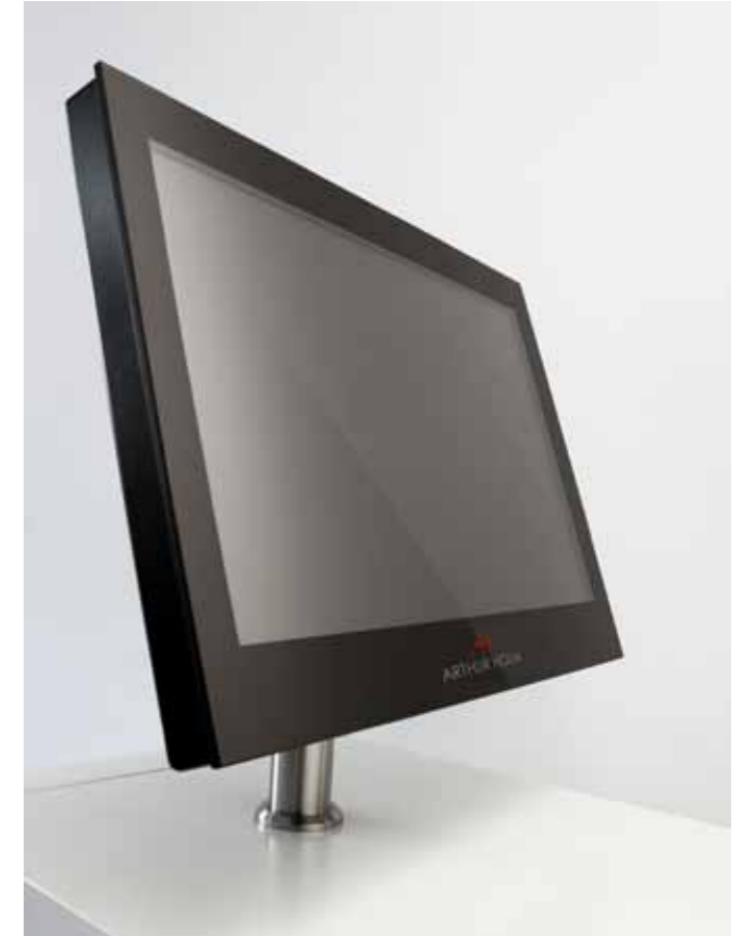
Front and rear of Gooseneck monitors with its stainless steel support

T able integration monitors where the base is built into the table or desk. Elegant screens specially designed for fixed table installation are made of milled aluminum with a stylish protective glass panel with black marking and a support made of stainless steel.