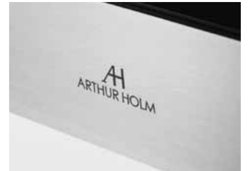
Attention to all details in the exclusive Static monitor range