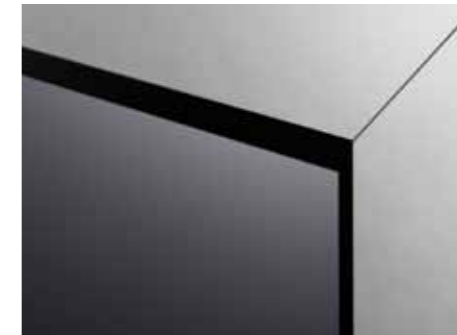
Detail of the stainless steel frame and protective glass panel

Static has an elegant stainless steel frame and a protective glass panel with black marking. With its slim design, the monitor takes a minimum space and fits onto standard wall brackets and can also be built into the wall. They are available from 32 to 82".