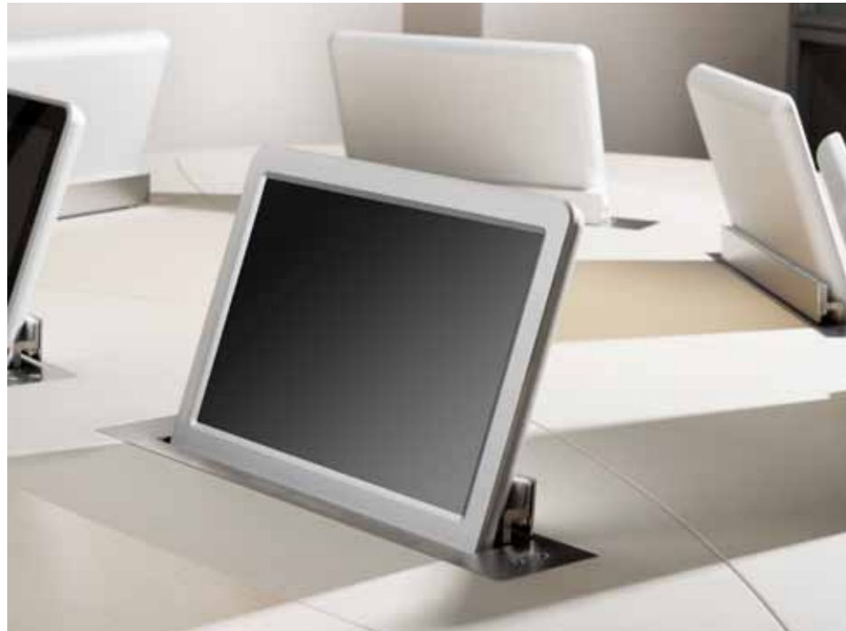
Meeting room table with Arthur Holm Dynamic monitors

Five reasons to work with Arthur Holm: design, ergonomy, quality, technology and flexibility