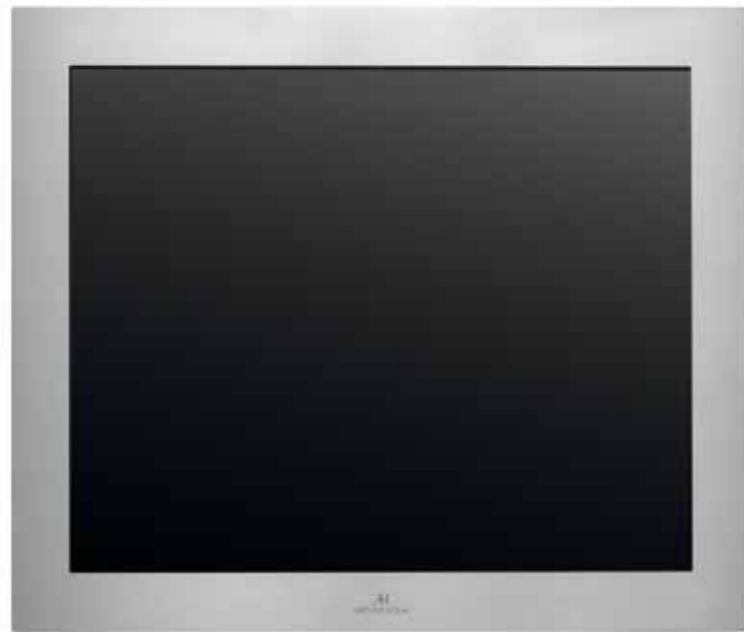
Drop monitor finished with stainless steel frame

D rop monitors have been designed for an easy in-wall installation. They are supplied with an external box for fix mounting, while the screen itself provides a “clip-on front” system.