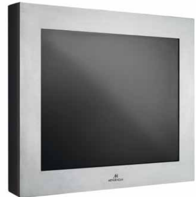
Rise monitor finished in anodized aluminum

R ise monitors have been designed to be used to provide visitors with a warm welcome, directions and information. They are available in several sizes and finished in glass with black marking, stainless steel or aluminum.