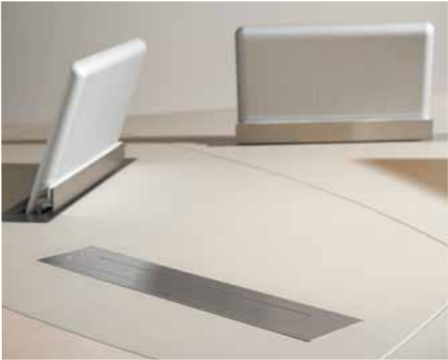
Total control with AHnet software