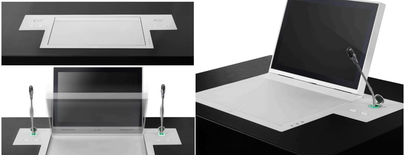
This picture corresponds to a customized version of Dynamic3Talk